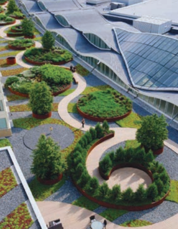
ABOVE The rooftop deck of the residences at the Natick Mall RIGHT Grand Canal Square in the Dublin Docklands