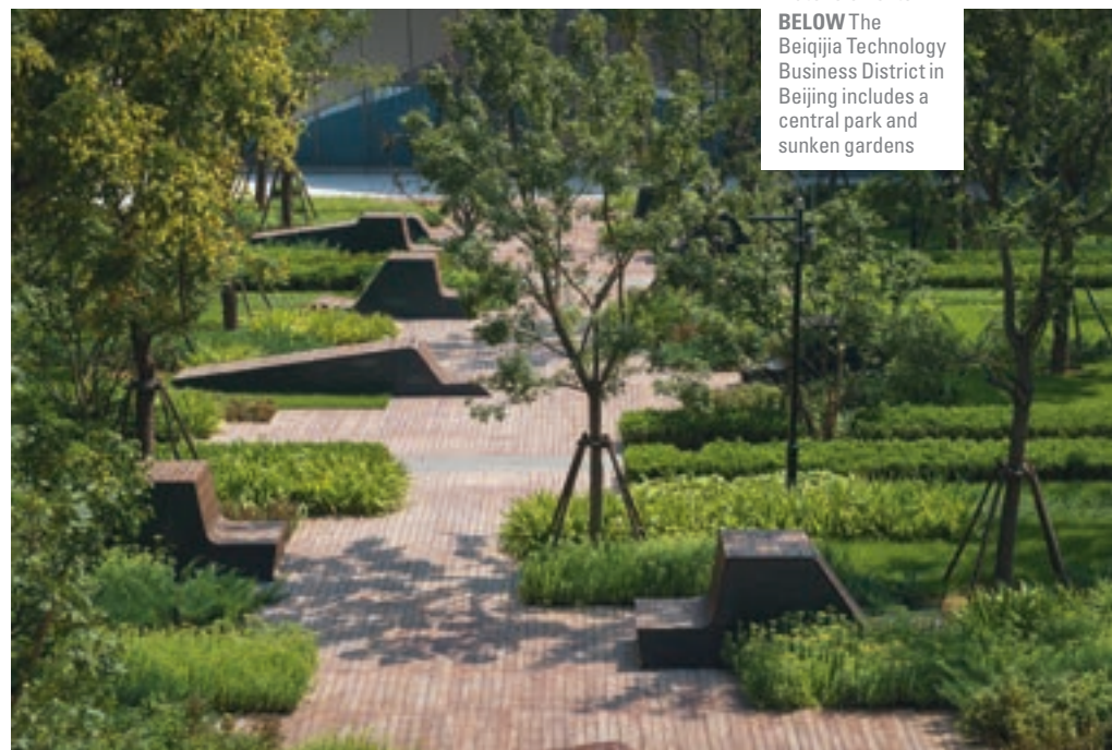
BELOW The Beiqijia Technology Business District in Beijing includes a central park and sunken gardens