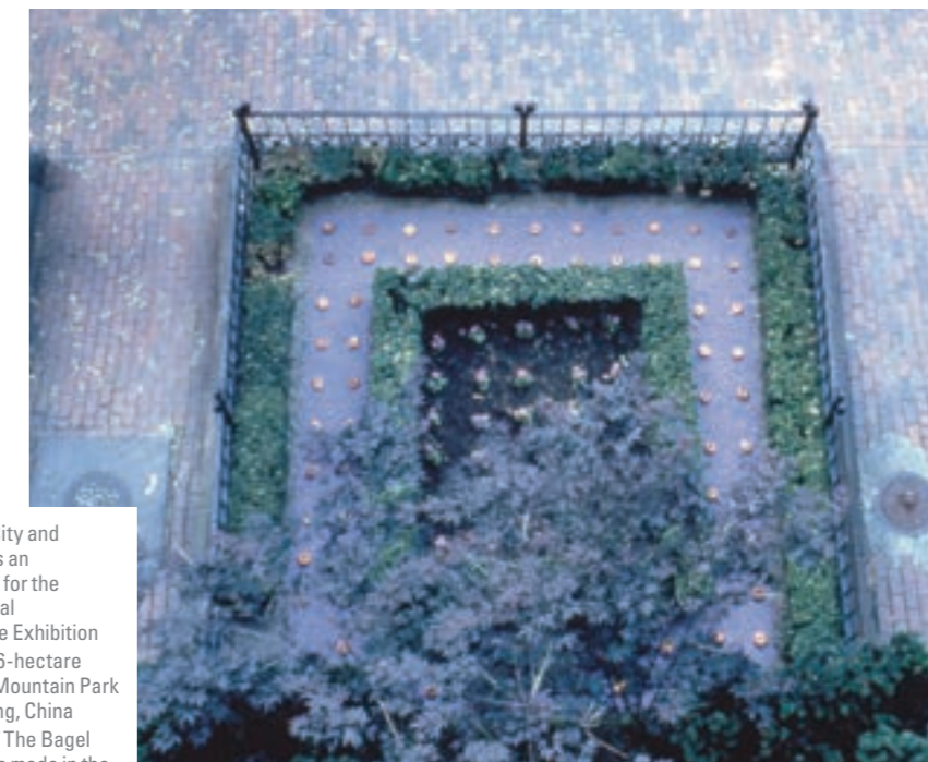
FAR LEFT City and Nature was an installation for the International Horticulture Exhibition LEFT The 16-hectare Fengming Mountain Park in Chongqing, China TOP RIGHT The Bagel Garden was made in the front garden of her own Boston house in 1979 CENTRE RIGHT The Splice Garden was created on the rooftop of the Whitehead Institute in Cambridge, MA BELOW RIGHT The garden of the Dickinson Residence in Santa Fe