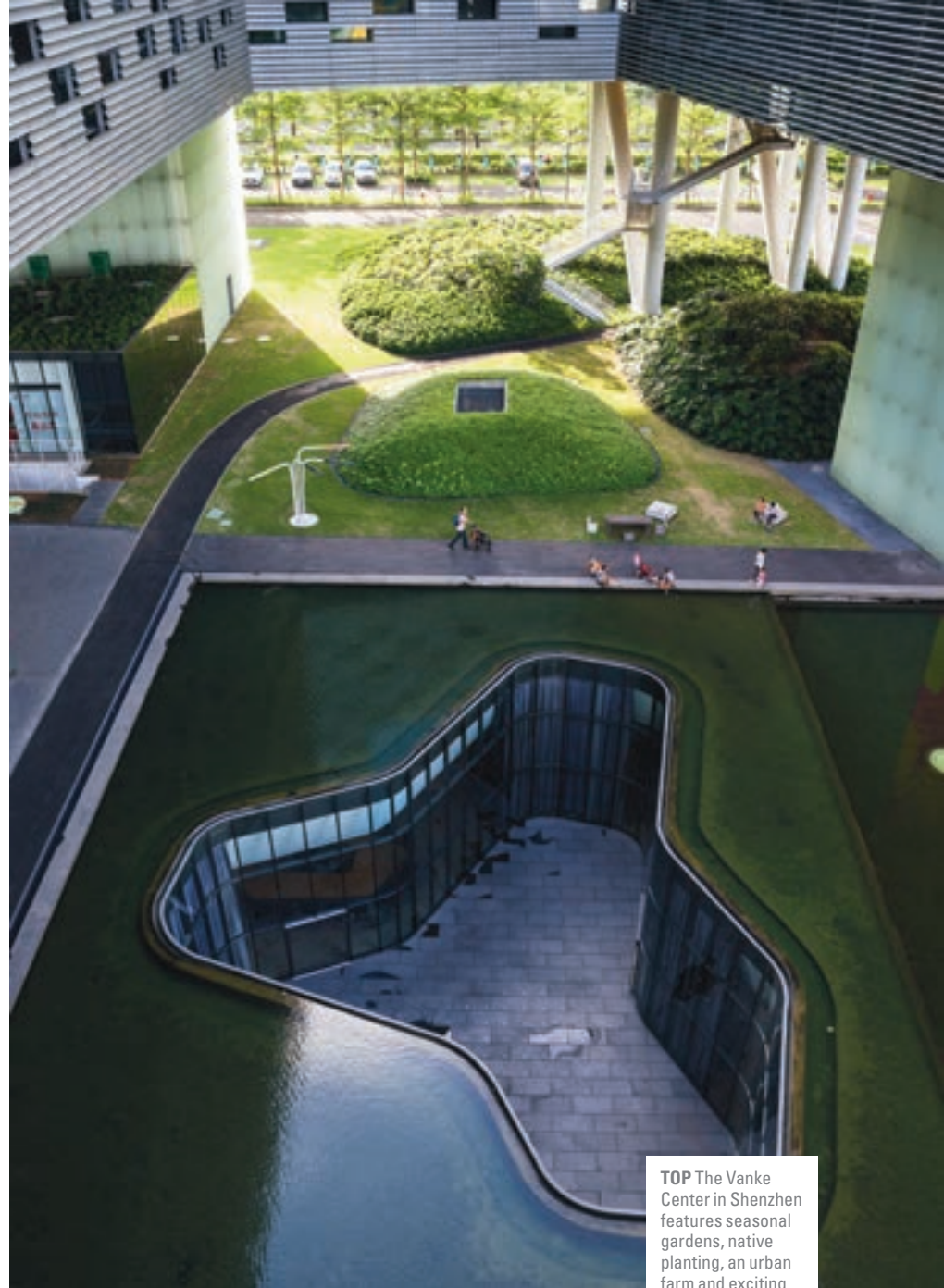
TOP The Vanke Center in Shenzhen features seasonal gardens, native planting, an urban farm and exciting water elements